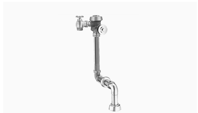
Variation Not Shown: 3" Metal Oscillating Push Button